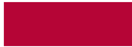
Crimson Red SPR0291X