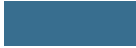
Hawaiian Blue SPL0299X