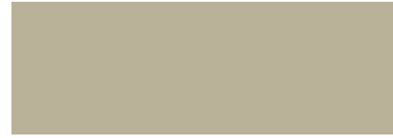
Desert Sand SPD0413X