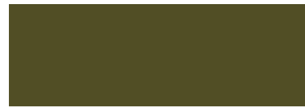
Burnished Slate SPB0384X