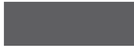
Charcoal Gray SPA0369X