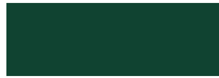
Fern Green SPG0372X