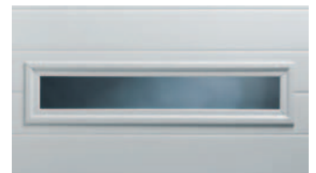
24" X 4" PLEXIGLAS