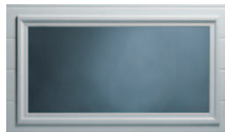
24" X 12" SSB OR INSULATED GLASS