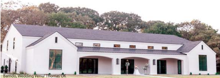
Barndo, Wedding Venue / Thomas OK