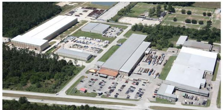
Rigid's Corporate Manufacturing Facility 400,000 Sq. Ft

9250 East Costilla Ave, Suite 325 - Greenwood Village, CO 80112 Toll Free: 800-658-2885 - Fax: 303-799-4803