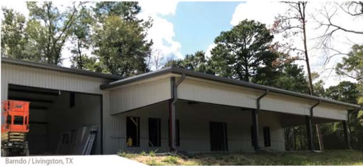
Barndo / Livingston, TX