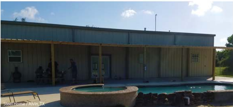
Steel Home / Alvin, TX