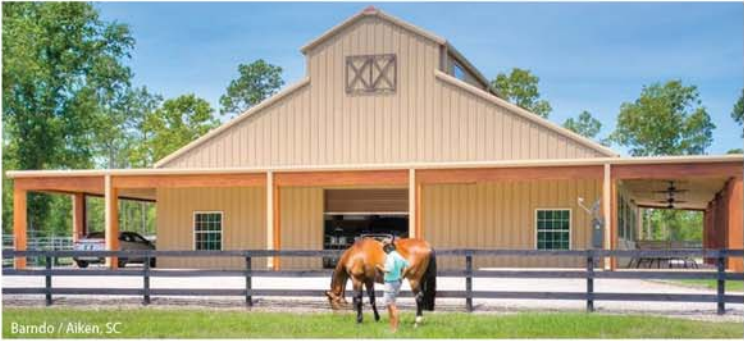
Barndo / Aiken, SC