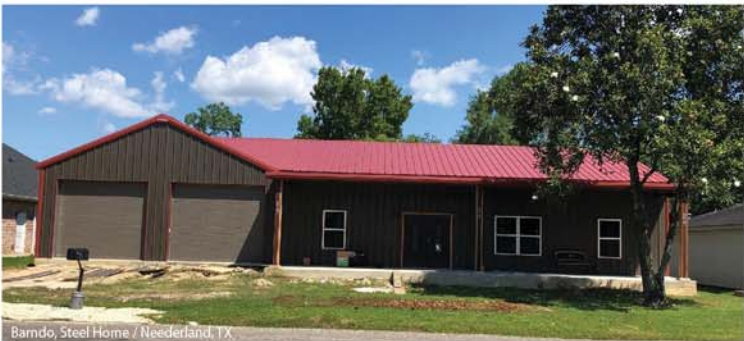
Barndo, Steel Home / Neederland, TX