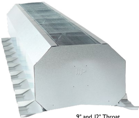
9" and 12" Throat Continuous Ridge Ventilators